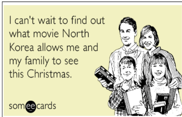
Pic. 7. “Addressing to the family” [12]