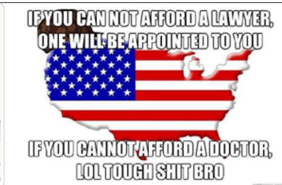
Pic. 8. “Addressing to national values” [12]

Nevertheless, everything is not as bad as it seems. Battle with fake information can be won if individuals query every piece of information they meet. To succeed with the task individuals are to develop their own critical thinking because that is the only path to media literacy that can help to resist fake, unchecked or purposely created information as well as facts. Remembering Bloom’s Taxonomy it is useful to stress out that the ability to analyze occupies the fourth place out of six (remembering, understanding, applying, analyzing, evaluating and creating) [5]. Ability to analyze is to be the core issue of manipulation resistance. Thus, critical thinking is essential and can not be substituted with any other feature of individual social development. According to Robin Wood “critical thinking is the process of using reasoning to discern what is true,