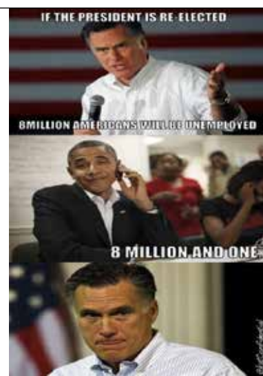
Pic. 2. "8 Million" [10]