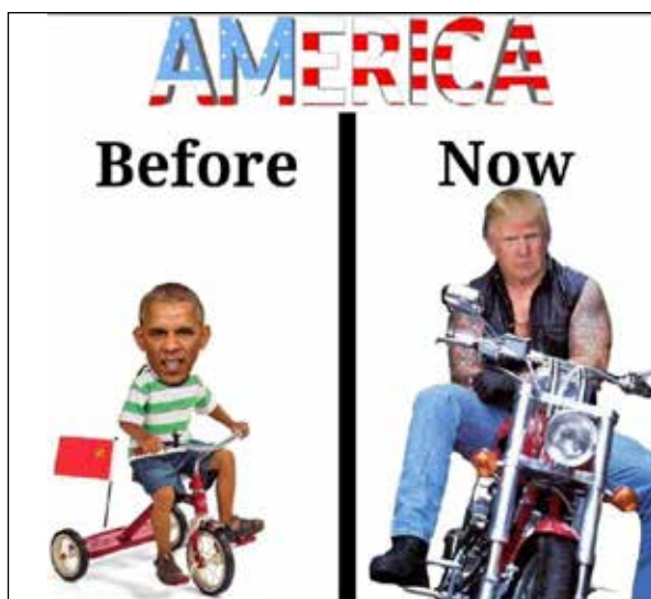
Pic. 1. "Before and Now" [10]