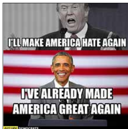
Pic. 5. "Background" [12]