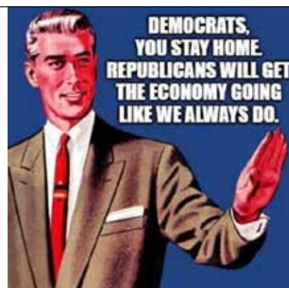
Pic. 6. "Main Character" [12]