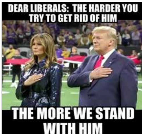
Pic. 3. "Black Frame" [12]

Another question is how can all these factors work? The answer is quite simple – our brain can remember more than our eyes do. Moreover, it can keep and notice the information the individual has not even paid attention to. It happens automatically. The more often we meet the same memes' content the more chances arise that our brain will definitely remember it and will further accumulate as our own one, in other words – produced by our own brain activity. This cat will jump quite high in cooperation with Mandela Effect.